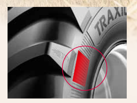
STRAIGHT SIDEWALL For maximum width and lateral stability