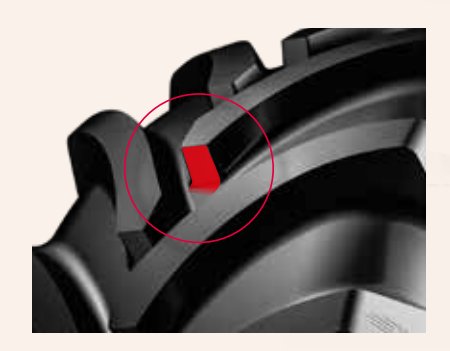
ANGLED LUG NOSE Can easily push away sharp stubble